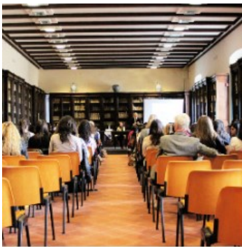
Facilities - Pg. 37