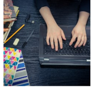
Education & Training - Pg. 26