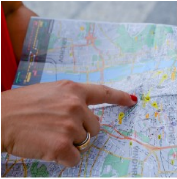
Attractions & Places of Interest - Pg. 3