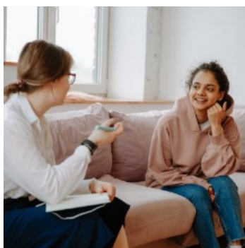
Support Services - Pg. 82