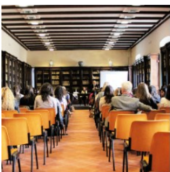
Facilities – Pg. 37