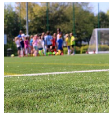
Sports & Recreation – Pg. 67