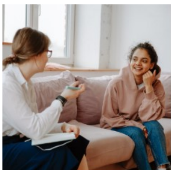
Support Services – Pg. 77