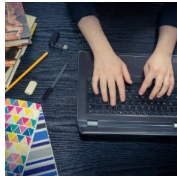
Education & Training – Pg. 26