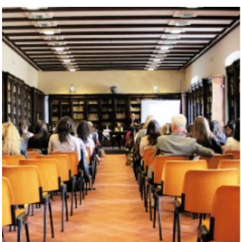
Facilities – Pg. 36