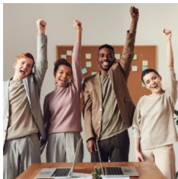
Community Organisations – Pg. 8