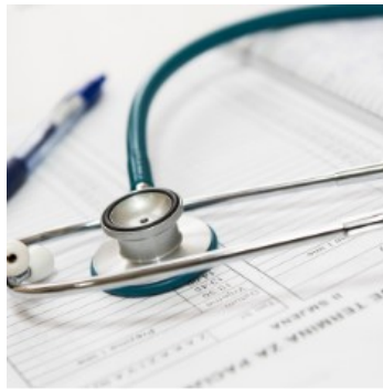
Health & Wellbeing – Pg. 48