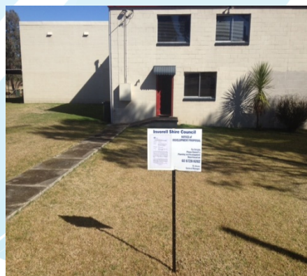
Photo 1 – Example of advertised Development Application sign at the site of the proposed development

The EP&A Act 1979 and other State Environmental Planning Policies may specify circumstances where certain applications require advertisement. In certain circumstances, Council may choose to advertise a development not listed above if it is considered necessary on the basis that it is in the public interest.