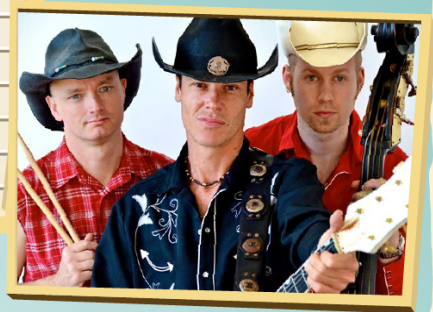
Christian Power & Lonesome Train