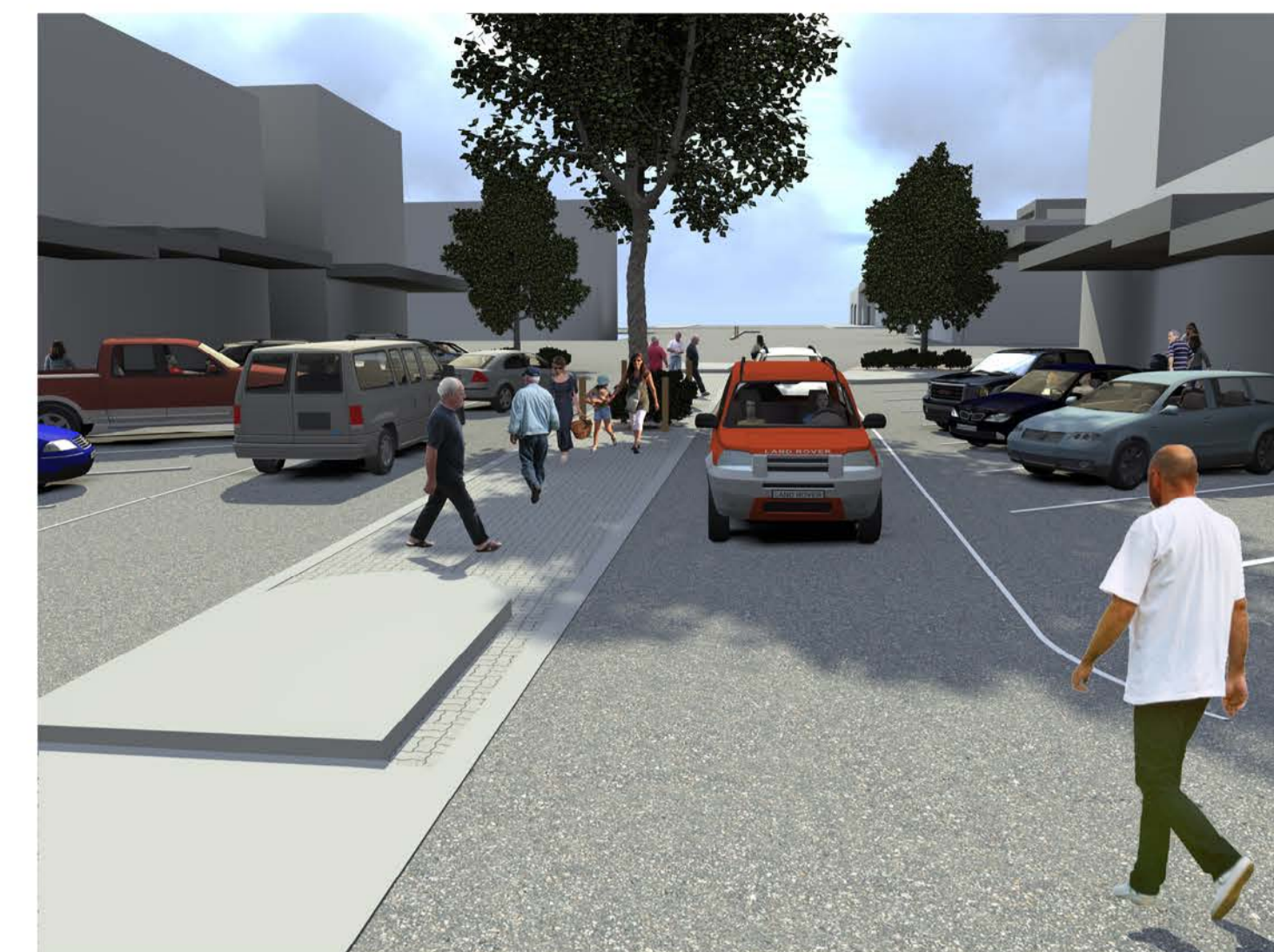
VISUALISATION OF ROAD TREATMENT