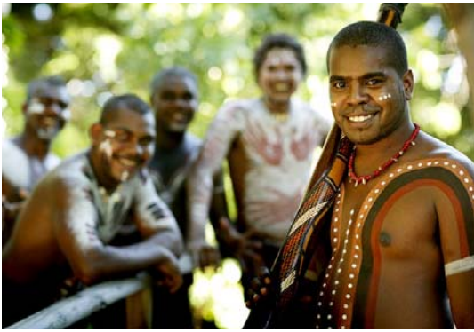
Aboriginal & Torres Strait Islander – Pg. 3 Support Groups | Services