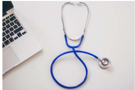
Health Services – Pg. 17 Medical Support Services | Mental Health | Seniors – Accommodation, Care & Support