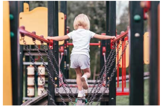
Children's Services – Pg. 4 Services | Childcare